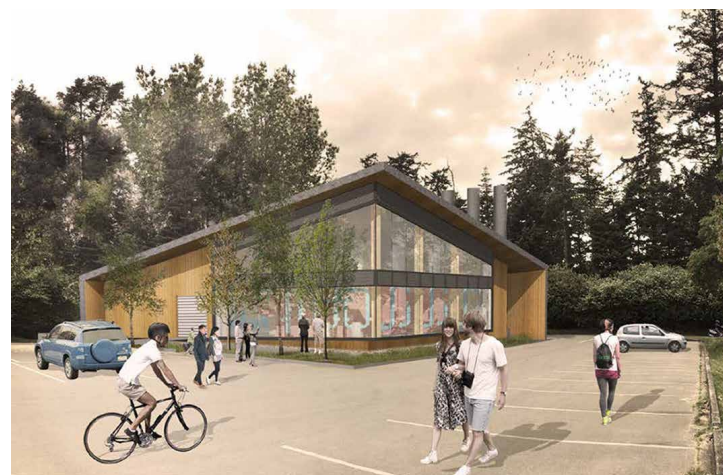
The new District Energy Plant is scheduled to be completed and operational in 2018.

In 2017, UVic broke ground on a new District Energy Plant. The new Plant will include three new high-efficiency natural gas boilers. The plant will allow for the decommissioning of three older, less efficient, boiler plants on campus. New energy transfer stations will also be installed throughout the district energy system allowing