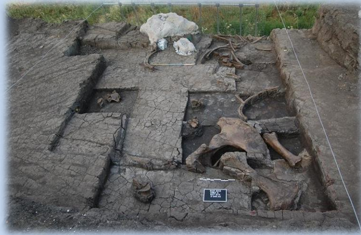
Paleolithic elephant butchering site found in Greece

http://www.uvic.ca/socialsciences/anthropology/