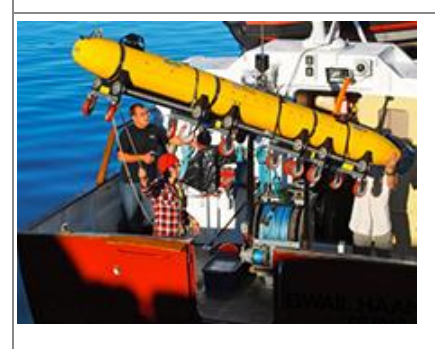
Readying the AUV