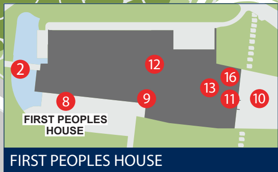
FIRST PEOPLES HOUSE