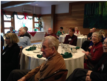
Our annual Christmas Luncheon at the University Club. December 11, 2015