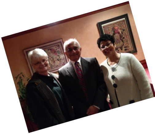
The Diwali Lunch, Diwali, also known as 'The Festival of Lights', is an ancient Hindu festival celebrated in autumn every year. November 13, 2015