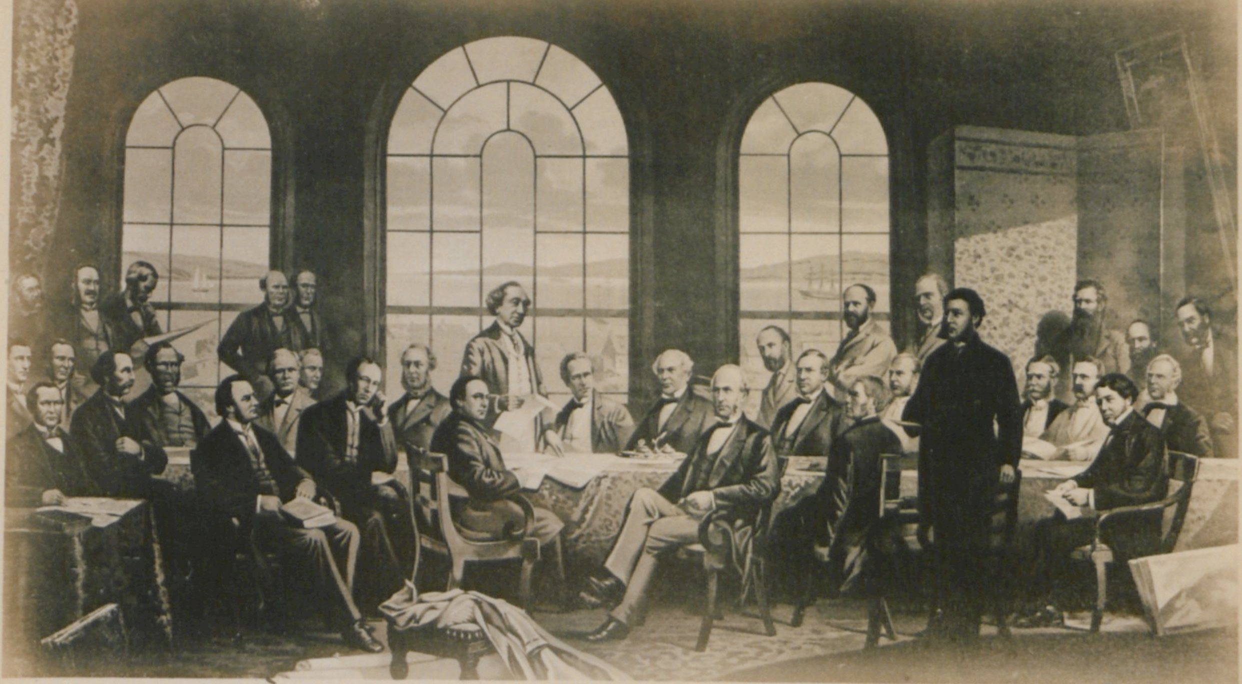
PEERES DE LA CONSTITUTION 1848