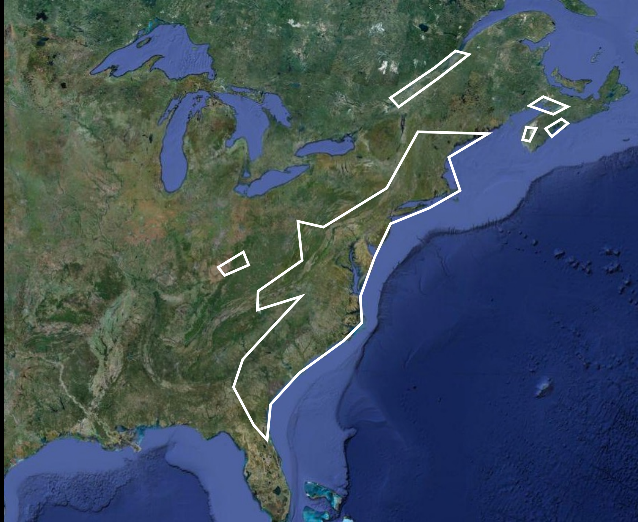
Colonial settlement in eastern North America, circa 1780