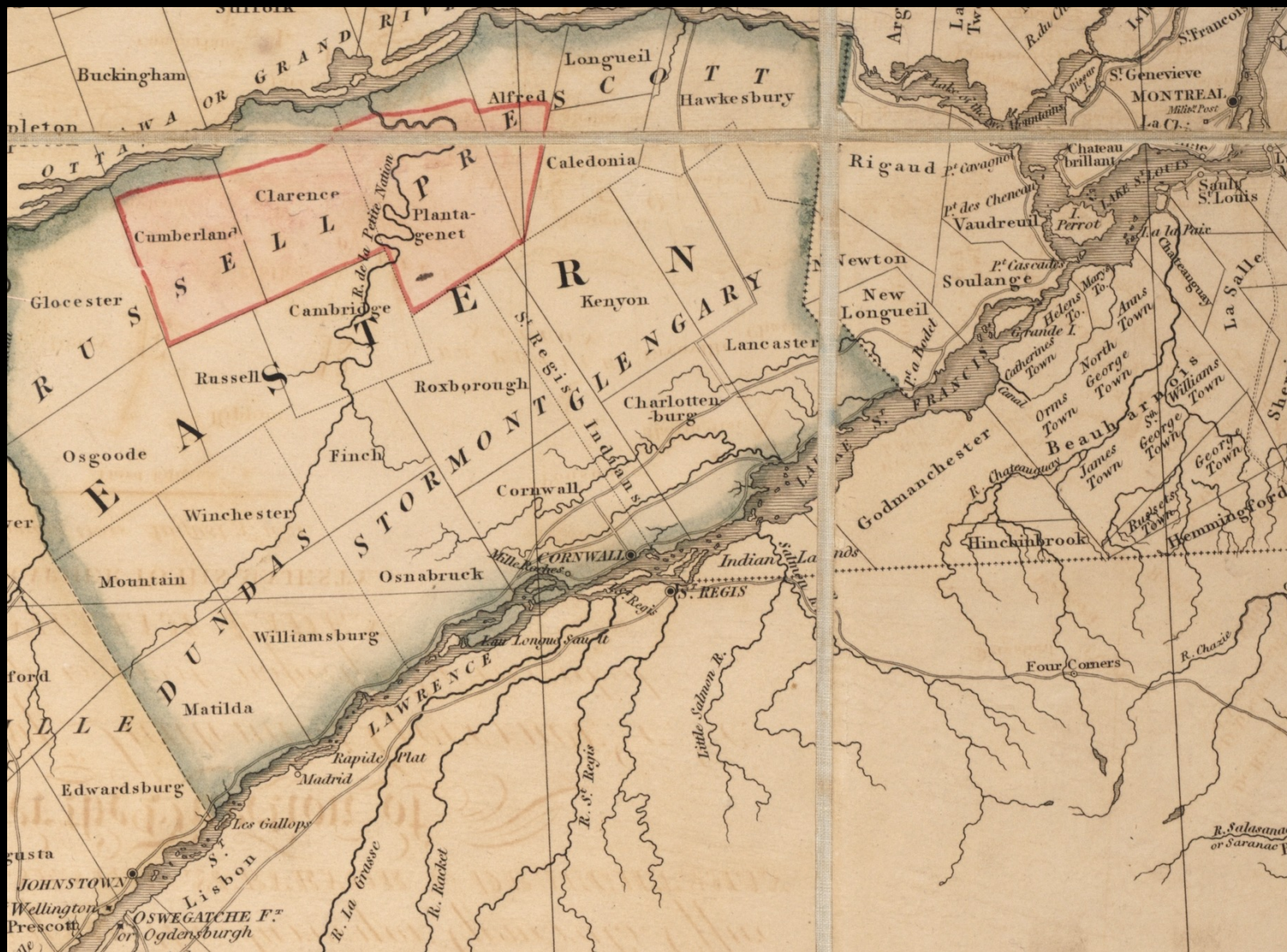
Detail of a map published at London in 1813 showing St Regis (Akwesasne) and the Indian Lands in Upper Canada.