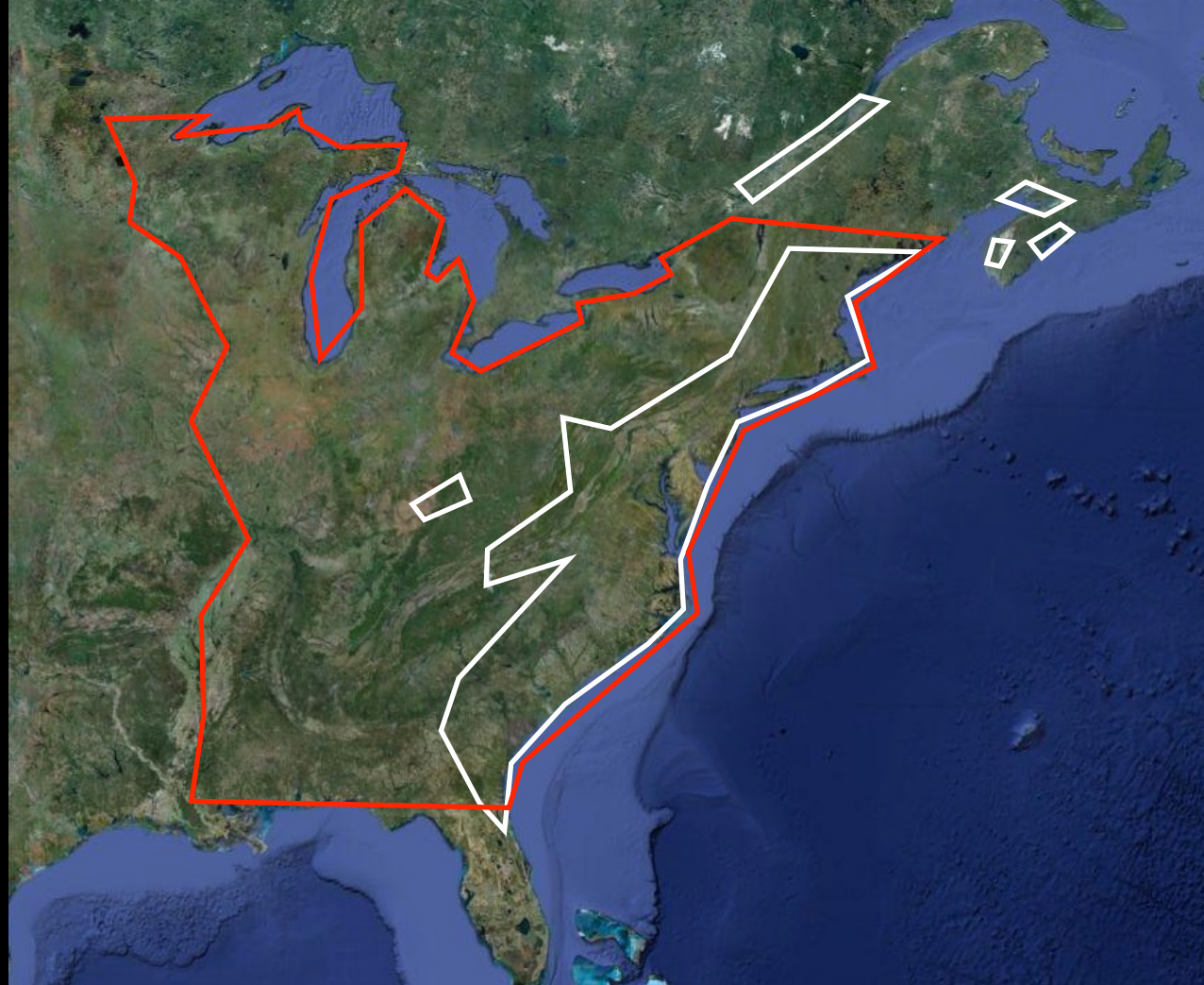
United States boundaries, 1783