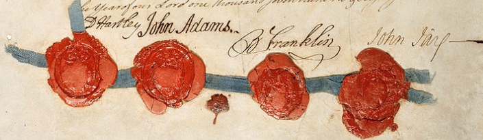
Final page of the Treaty of Paris, 3 September 1783

Charles John Adams. B. Franklin John Jay