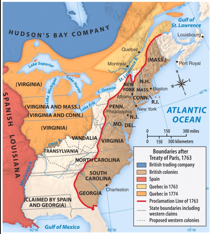
This map illustrates the territorial boundaries of North America following the Treaty of Paris in 1763. It shows the extent of British trading companies, British colonies, and Spanish territories. The Proclamation Line of 1763 is clearly marked, along with state boundaries and proposed western colonies. The map also includes geographical features like the Gulf of St. Lawrence, Gulf of Mexico, and various lakes and rivers.