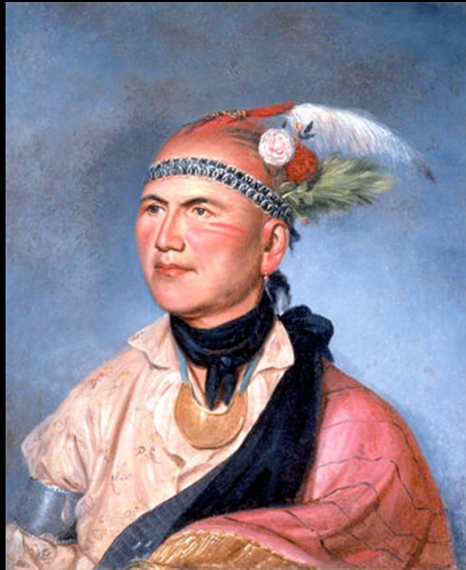
Brant by Charles Willson Peale, 1797