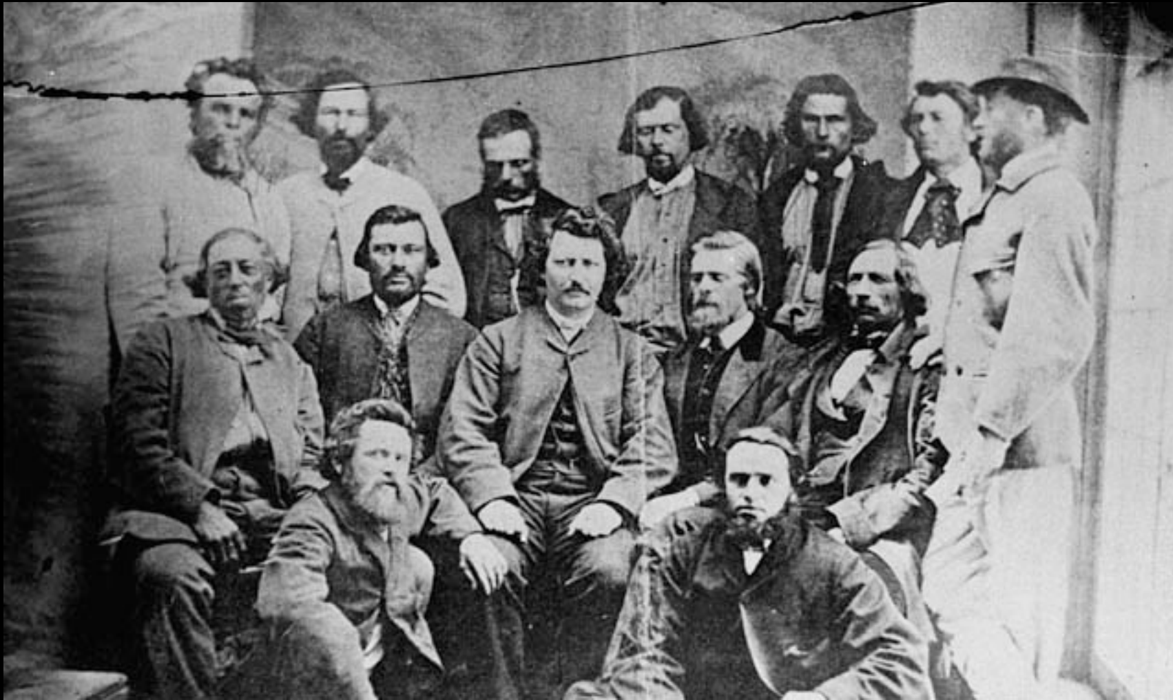
The Métis provisional government of 1869-70. Louis Riel is seated at centre.