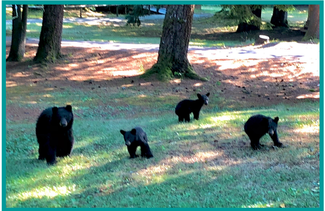
Mumma bear and cubs

at the Cheakamus Centre Outdoor School in Squamish