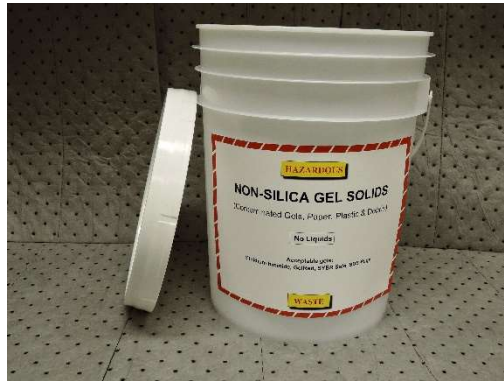
Non-silica Gel Solids