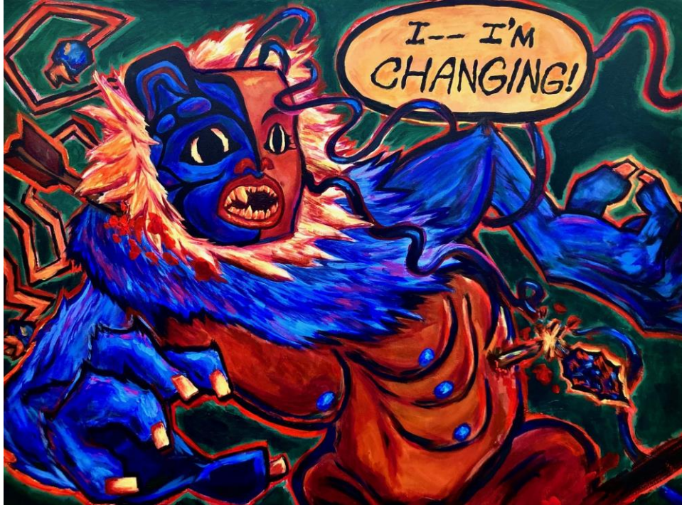
Title: "Night of the Wolf Woman!" (2023)