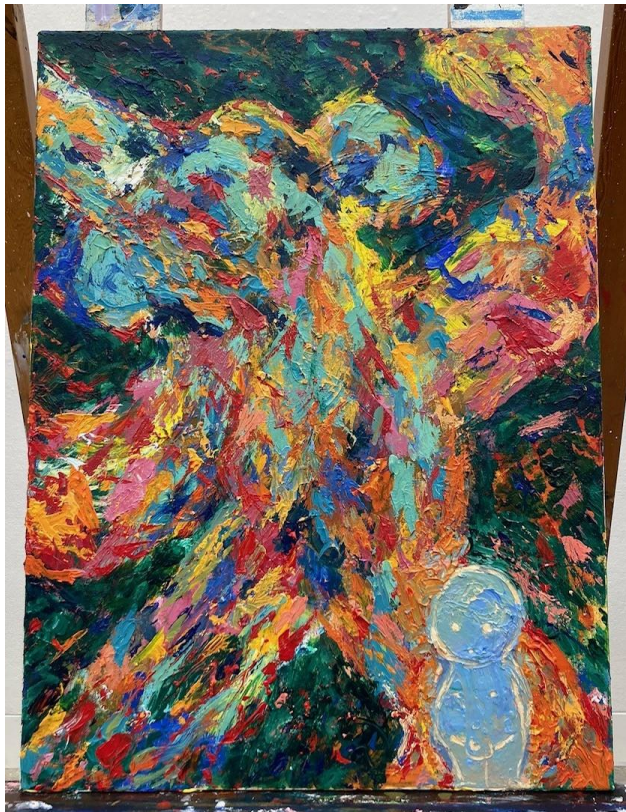
Title: "Elephant Dance" (2023)