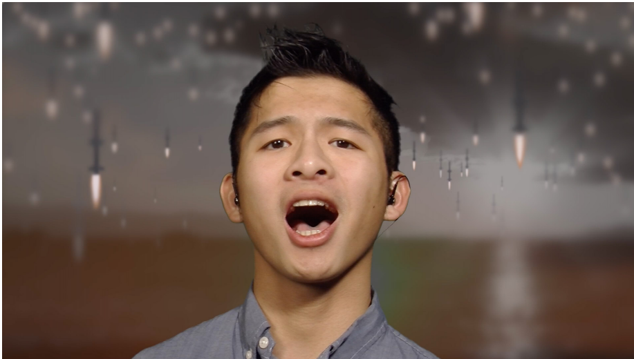
Bridge Over Troubled Water (Thomas), 2015, Video still

It is significant for me to explore the shifting role of artists in the digital era. In a time of saturated images, information, and "high-speed fetch", our role is now focused on selecting and preparing guidelines and then witnessing what technology can provide and manipulate. I am interested in exploring how technology used this way can produce effects beyond the artist's authorship and premeditated aesthetic. The lyrics of Bridge Over Troubled Water convey the message of friendship and support, which are fundamental, ageless human needs. In exploring new technology with this song, we celebrate the up-lifting spirit in humanity and the new ways of delivering it.