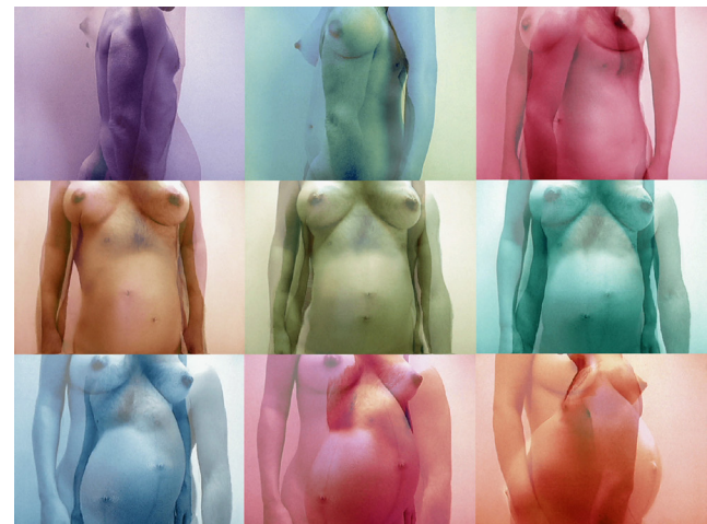
Coffin Crib, 2002, Video still