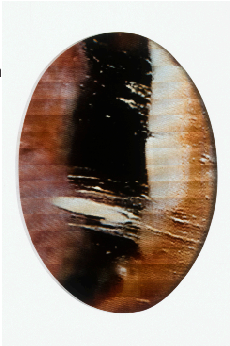
As If, 1996, Installation