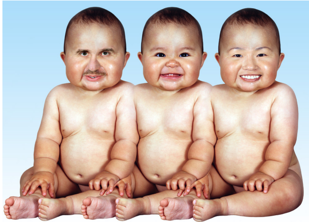
Three Buddhas , 2002, Giclée print