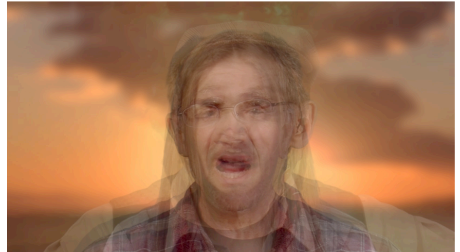
Bridge Over Troubled Water (Chris) , 2015, Video still