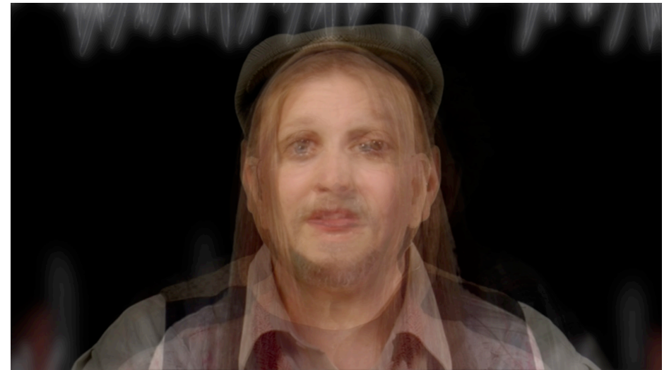
Bridge Over Troubled Water (Cam) , 2015, Video still