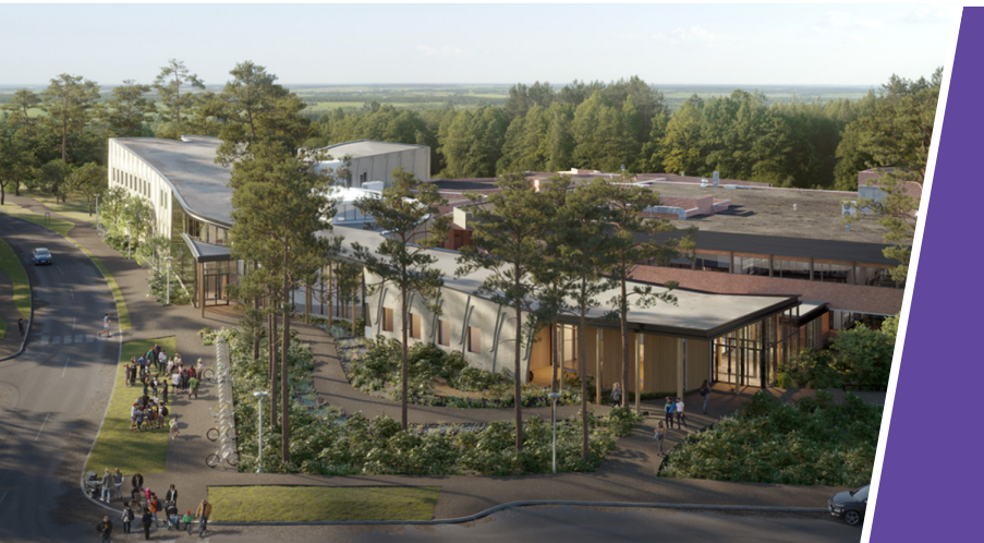
UVic Law is home to the joint degree program in Canadian Common Law and Indigenous Legal Orders, to the Indigenous Law Research Unit and the National Centre for Indigenous Laws.

UVic is situated in the territory of the Songhees, Esquimalt and \underline{W}SANEC peoples and sits on the site of an old Lək wəŋən village. Respect for the land's traditional stewards has inspired us to become leaders in environmental law, Indigenous law issues and public policy initiatives.