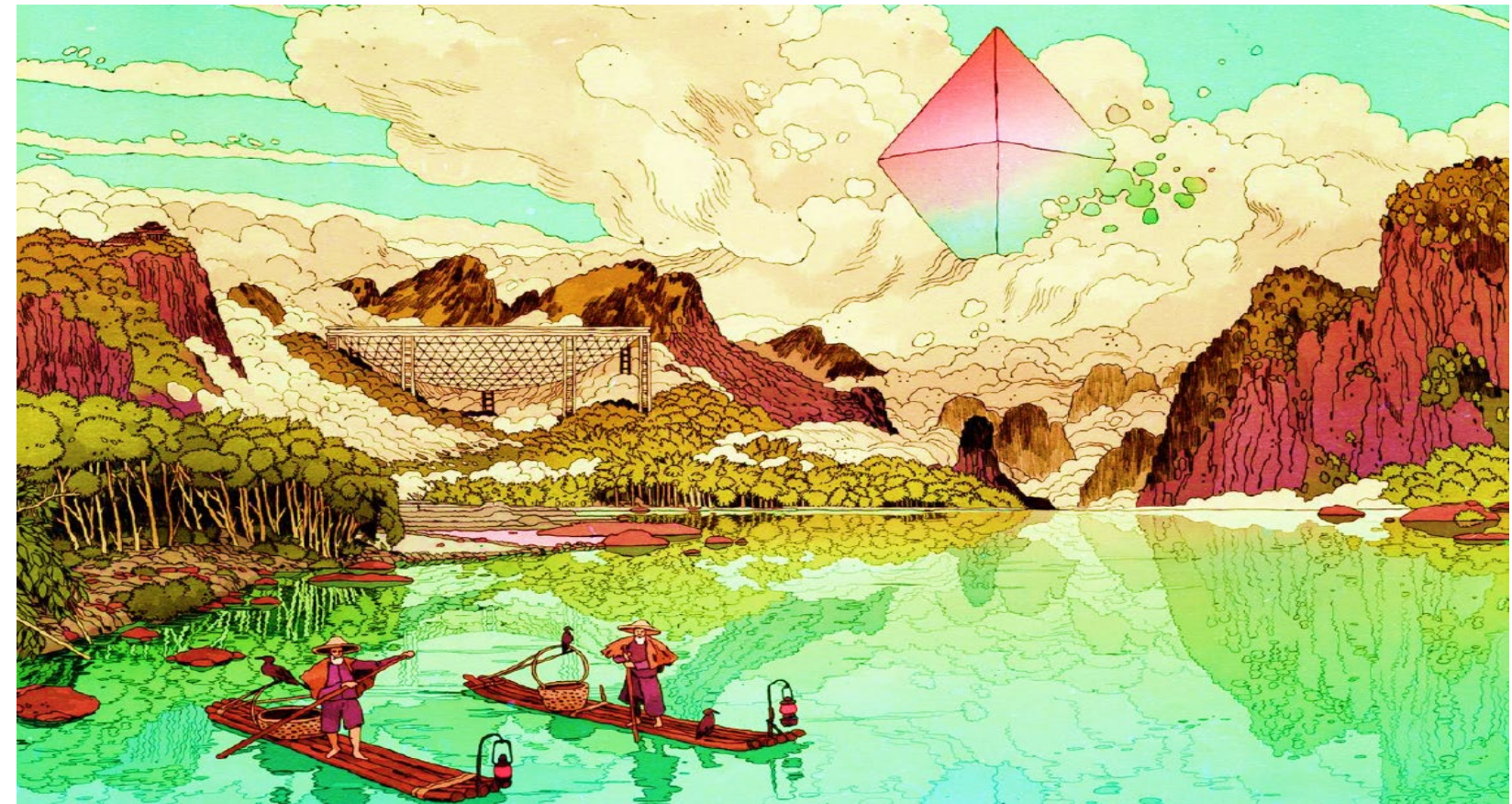
Chinese science fiction and The Three-Body Problem