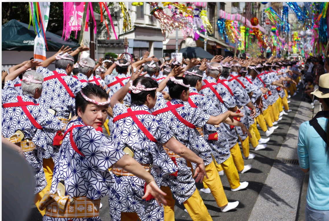
Dancers in the Tanabata Festival, Tokyo, Japan.

Please consider donating to our Student Research and Exchange Fund. No matter how small the amount, every bit will help us reach our initial goal of a $10,000 endowment.