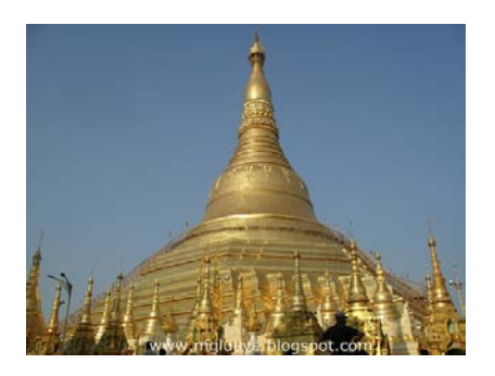
Shwe Dagon Pagoda, Burma

Those were only the formative years of what was to become the Department of Pacific and Asian Studies. You can only imagine how proud I feel to have played a small part in the embryonic stage of what has become an internationally known and respected Department of Pacific and Asian Studies at UVic. Please accept my congratulations and best wishes for continued success.