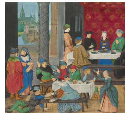
Master of the Dresden Prayer Book, Scenes of Temperate and Intemperate Living, c. 1475

Please join us on Saturday, February 4, 2023, for a look at the comforts, hazards, and secrets of daily life in the medieval household. From Beijing to Baghdad to Bergen, what was the level of material enjoyment and efficiency in medieval homes around the world? How many people slept in one bed? To what extent were belongings shared and safeguarded? What were the roles of children among other members of kith and kin? Who was included and excluded? Join us for a one-day exploration of medieval domesticity and daily life.