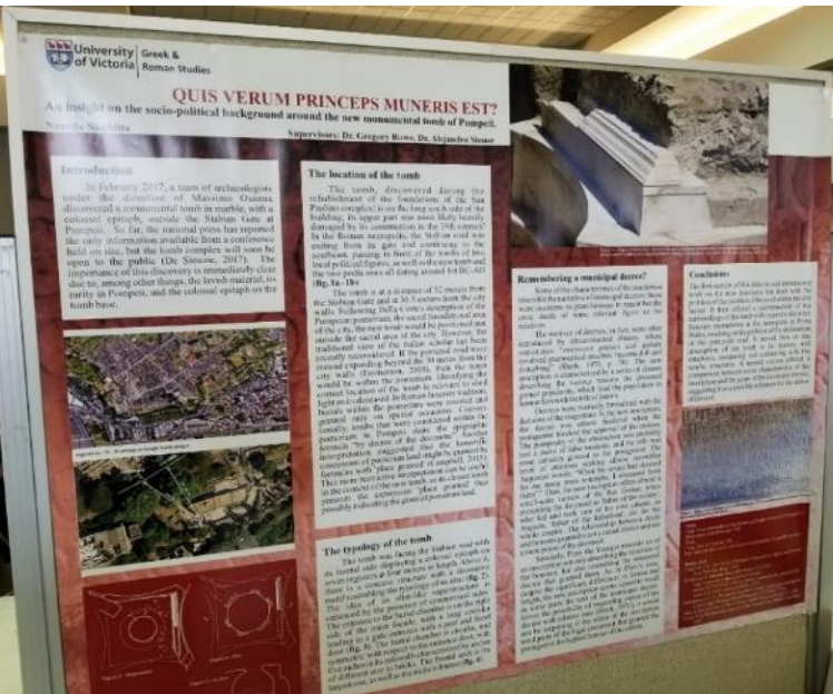
One JCURA poster - An Insight on the Socio-Political Background around the New Monumental Tomb of Pompeii