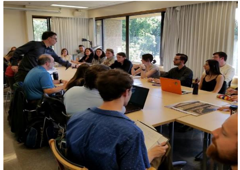
GRS Epigraphy Club