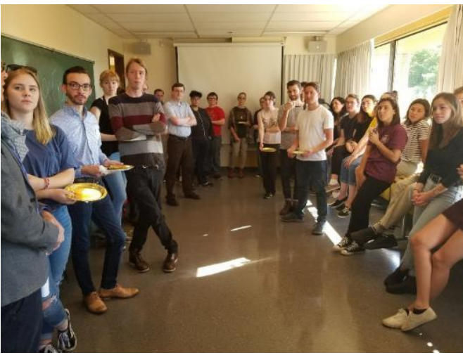
Meet and Greet 2017