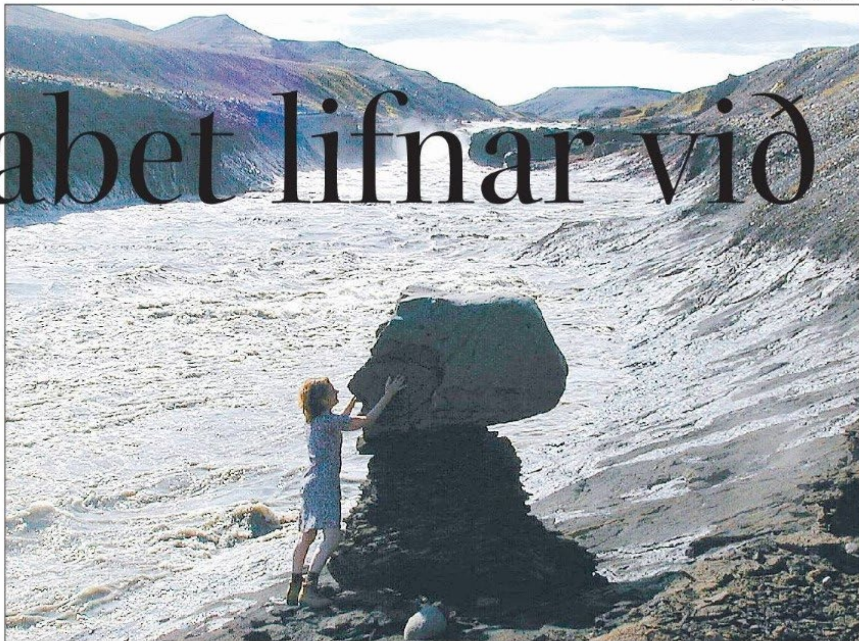
Jökla dansar einsog milljón hjörtu streymi á hverju sekúndubroti eftir ánni. Á einum stað er Gljúfrabúi sem hefur horft á hana öldum saman.