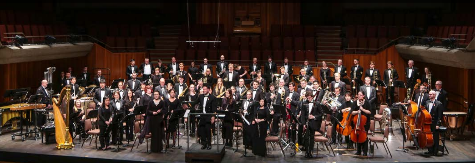
For over five years, UVic's Wind Symphony has presented combined concerts with The Naden Band of the Royal Canadian Navy