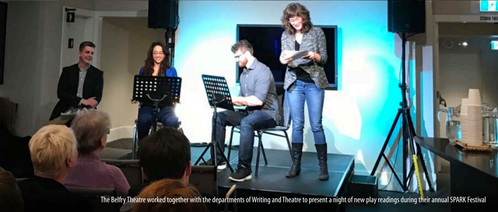
The Belfry Theatre worked together with the departments of Writing and Theatre to present a night of new play readings during their annual SPARK Festival