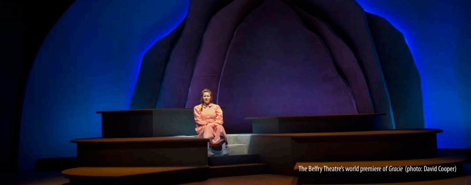
The Belfry Theatre's world premiere of Gracie