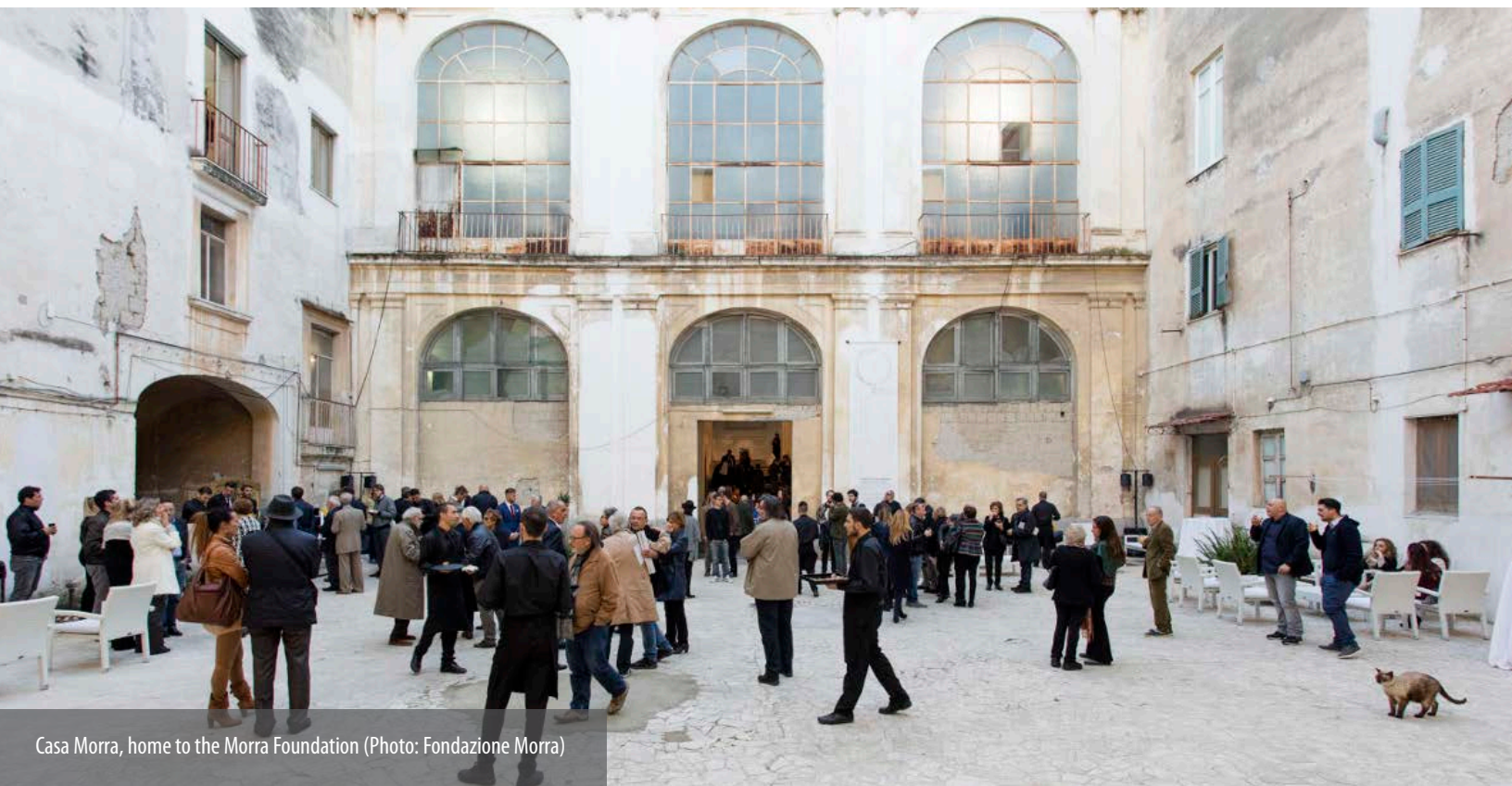
Casa Morra, home to the Morra Foundation