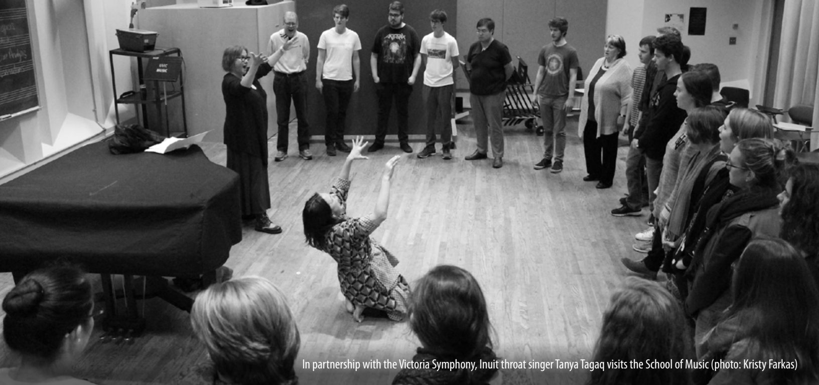
In partnership with the Victoria Symphony, Inuit throat singer Tanya Tagaq visits the School of Music