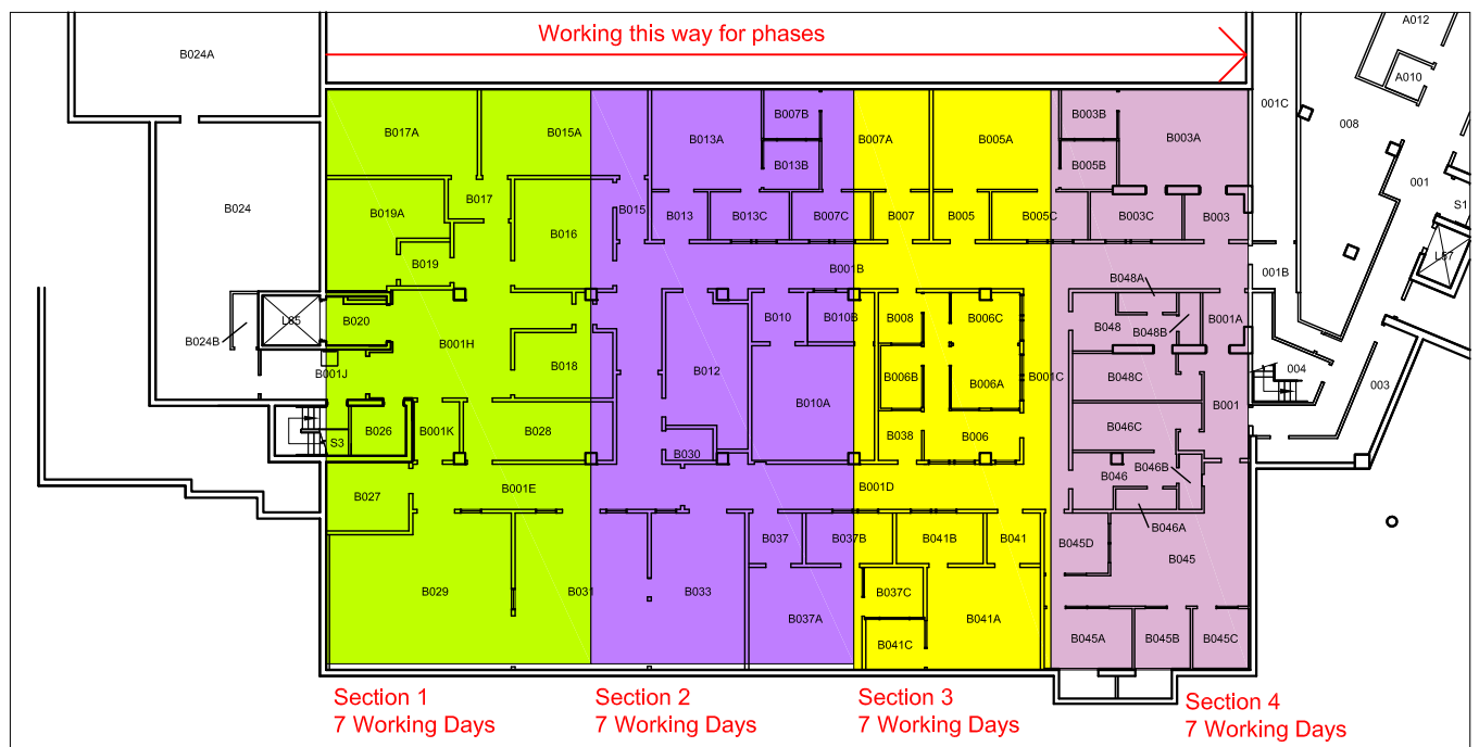
2 Level 0 Plan 1:400