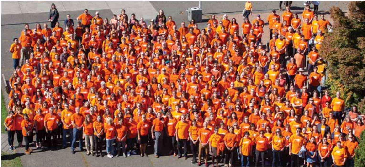
Caption here please.