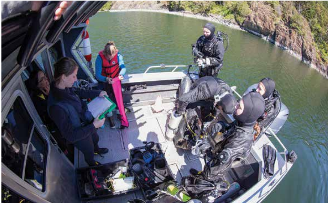
Caption here.

Woodburn's dive plan focuses on recording biological life—ling cod, crabs, bull kelp—in Ogden Point, southwest of Victoria, and outlines project goal and research techniques to quantify relative abundance of organisms in an area. Beginner divers fixate on equipment, checking air, buoyancy, pace of ascent and descent, as well as search and rescue drills. Dive plans account for emergency pro-