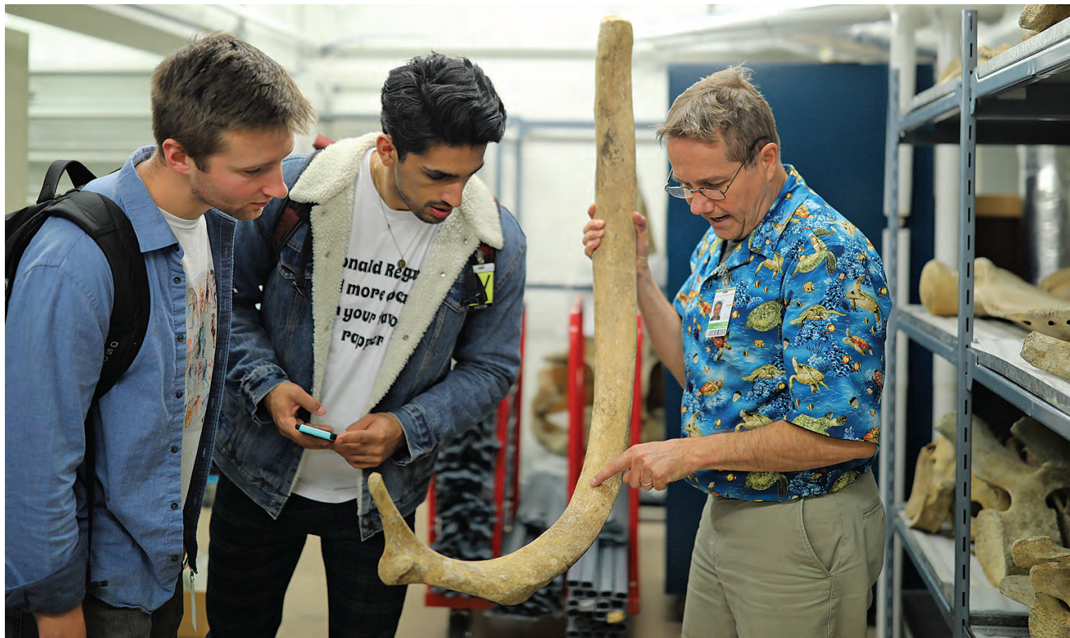
The Royal BC Museum houses 22 specimens of orcas, as well as porpoises, belugas and dolphins.