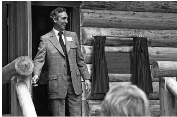
At the opening of the Simpson Forestry Station.