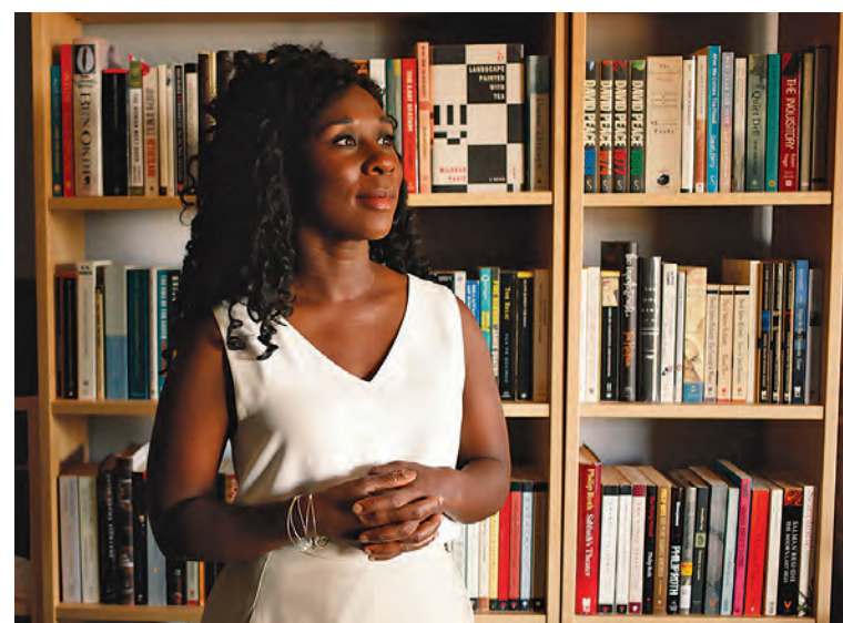
Edugyan.