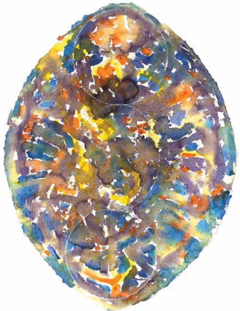
Free Flow, 2018, wax, wc, 48" x 36"