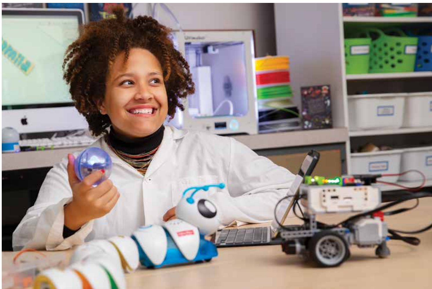
Franco in the lab.

Spring Convocation ceremonies will be webcast live on June 11–15. If you're not able to attend in person, you can watch the ceremonies on your computer at uvic.ca/convocation . Video of each webcast will be available for six weeks following Convocation. For event times and more information, visit uvic.ca/ceremonies .