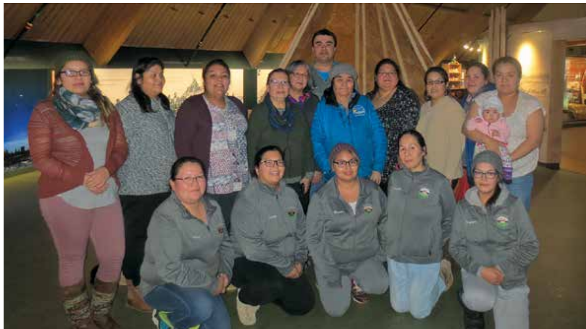
Fourteen members of the Chisasibi Heritage & Cultural Centre will travel to Victoria to graduate in June from the Certificate in Aboriginal Language Revitalization.