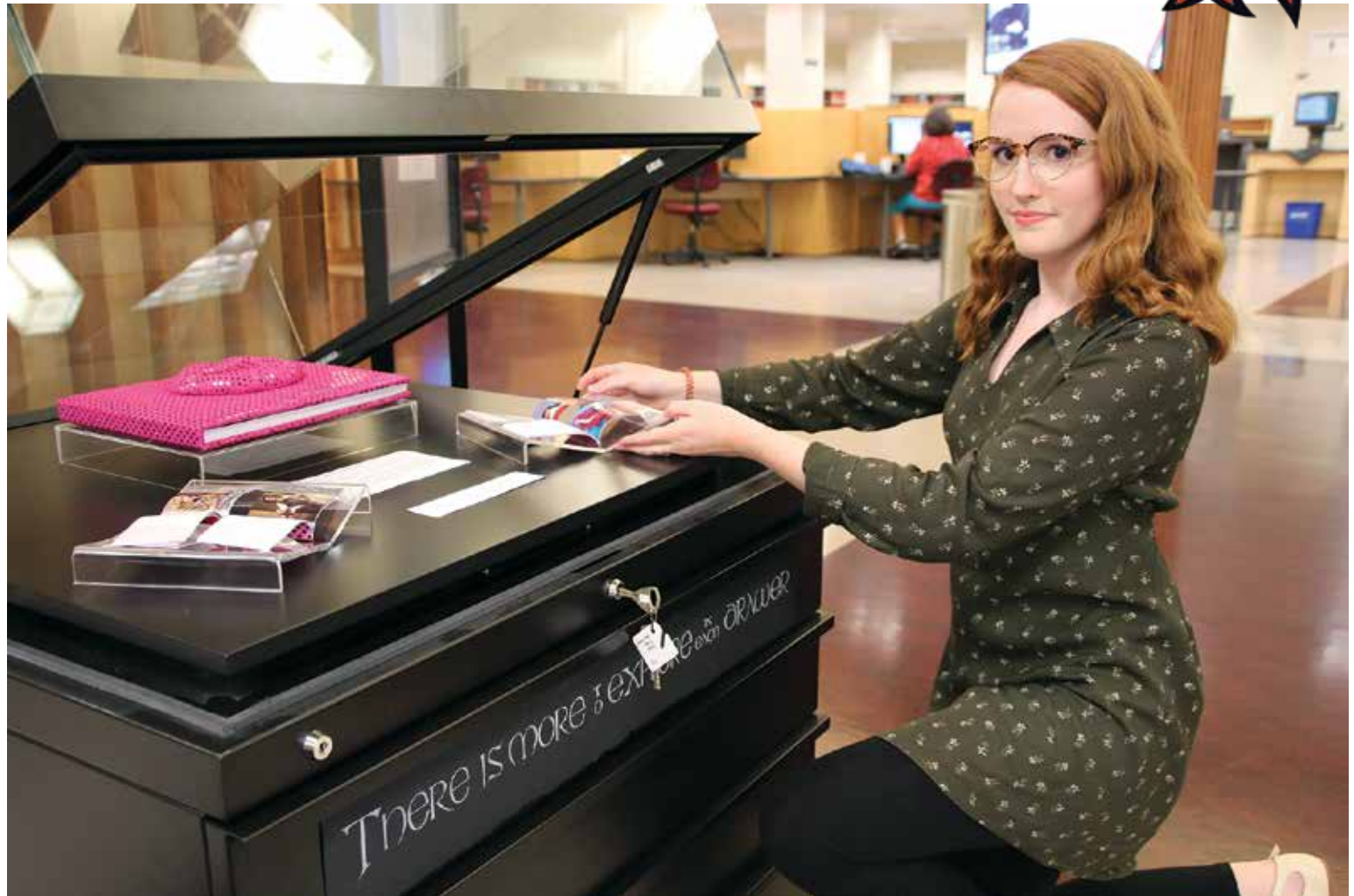
Greenhill installing an exhibit in the library's lobby display case. "People don't necessarily connect with the lobby case. I often see people just leaning on it with their coffee and I want to say, 'There's such cool stuff in here!'"

Heather Cape —BENG, Software Engineering