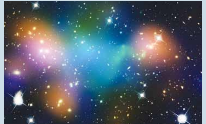
Composite image of Abell 520. The blue-green area indicates the dark matter clump.