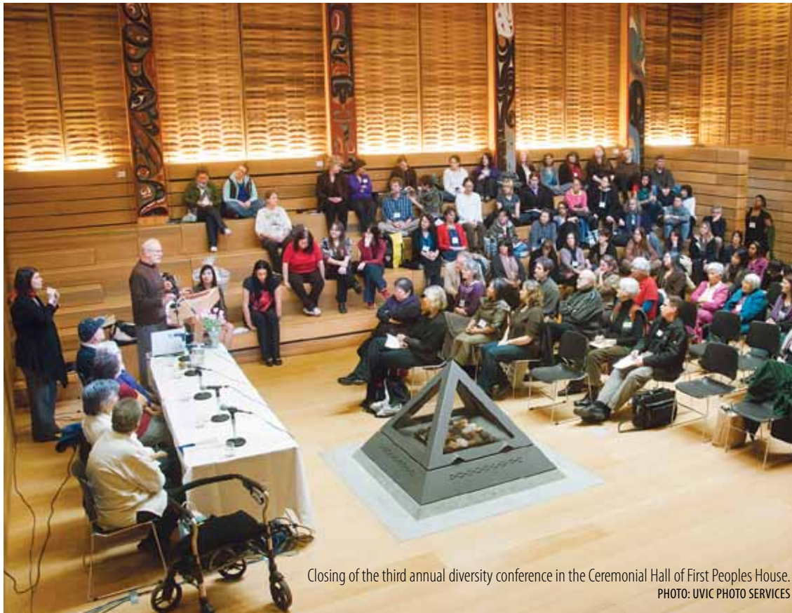
Closing of the third annual diversity conference in the Ceremonial Hall of First Peoples House.

If you are interested in joining the organizing committee for next year’s conference, contact Wong Sneddon at multi@uvic.ca or 250-721-6143.