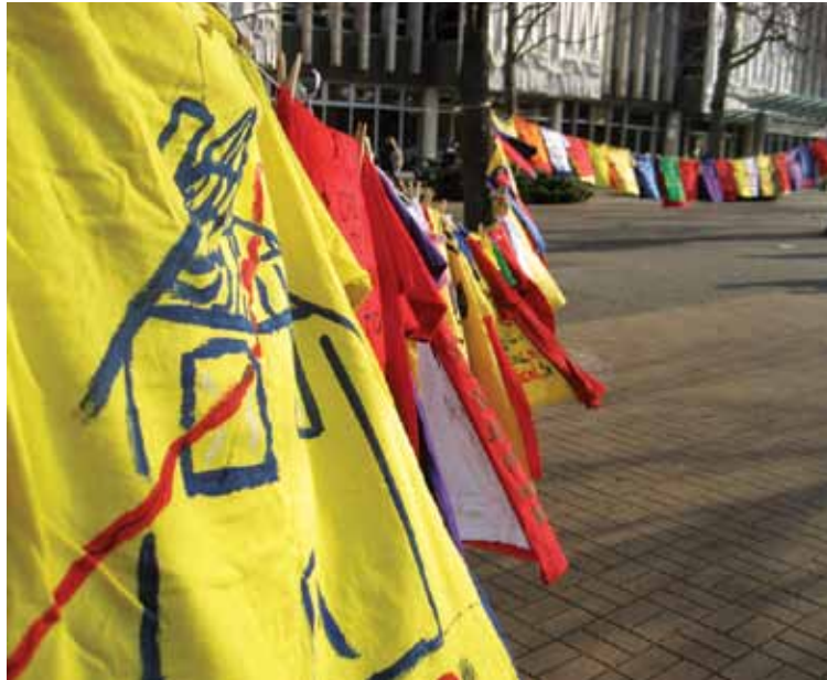
The clothesline project.