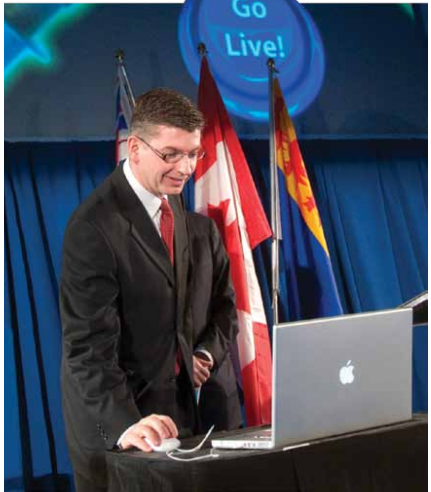
Iain Black, BC Minister of Small Business, Technology and Economic Development, launches the NEPTUNE data flow.

Led by the University of Victoria, NEPTUNE Canada pioneers a new generation of ocean observation systems that use innovative engineering and the Internet to provide continuous, long-term monitoring of ocean processes and events as they happen.