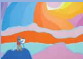
Detail from "Sketching Paradise" by Ted Harrison