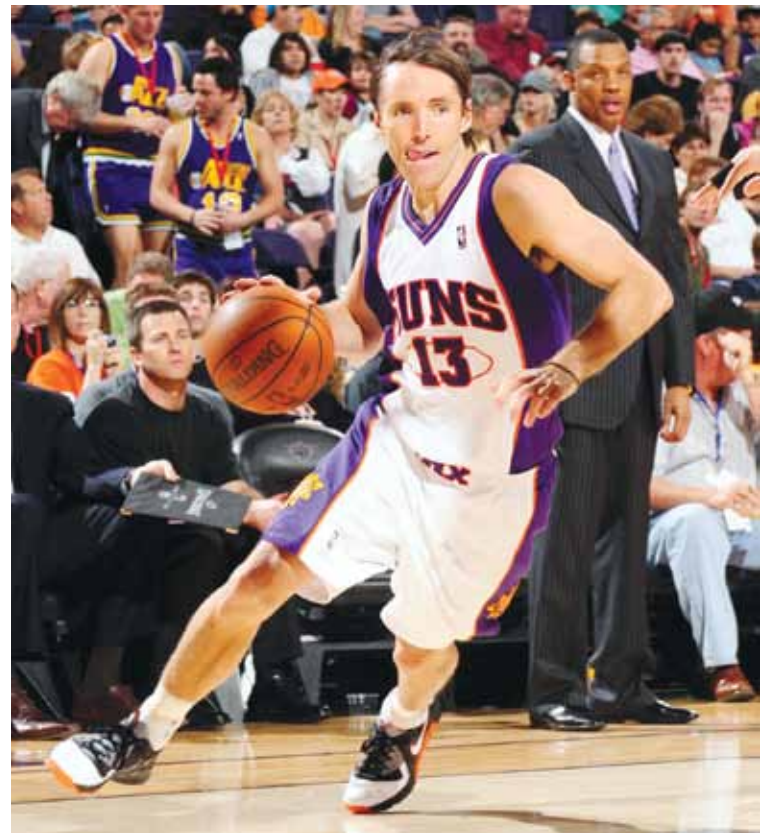
Nash.

He established the Steve Nash Foundation, a private charity dedicated to assisting underserved