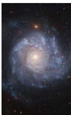
Spiral Galaxy.

The John Albert Hall Lectures are sponsored by the Anglican Diocese of British Columbia and the Centre for Studies in Religion and Society at the University of Victoria.