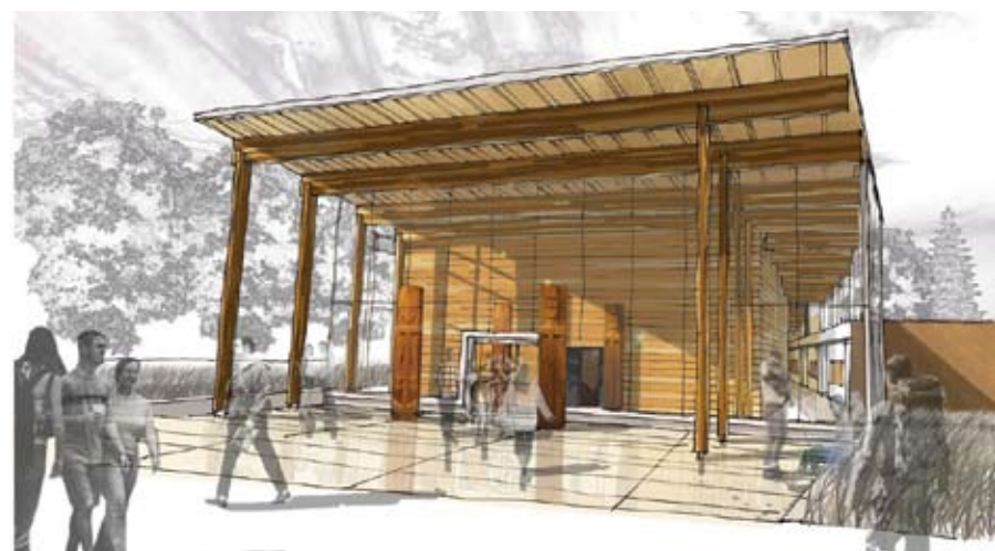
Architect's rendering of First Peoples House.

First Peoples House is targeted for completion in June 2009 and is expected to achieve gold-level certification with the Leadership in Energy and Environmental Design (LEED) Green Building Rating Standards program.