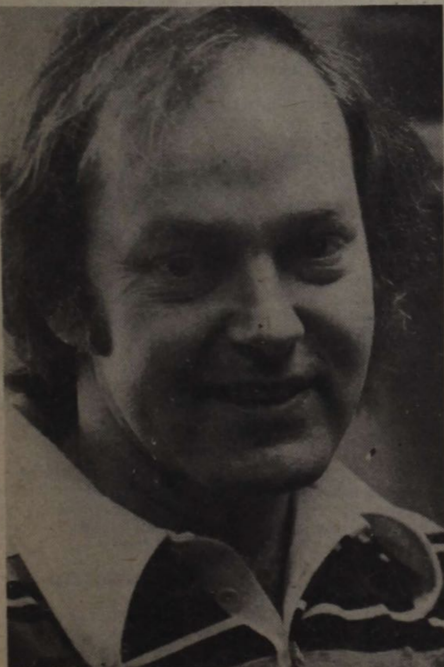
Webb: country folk heavy into drugs