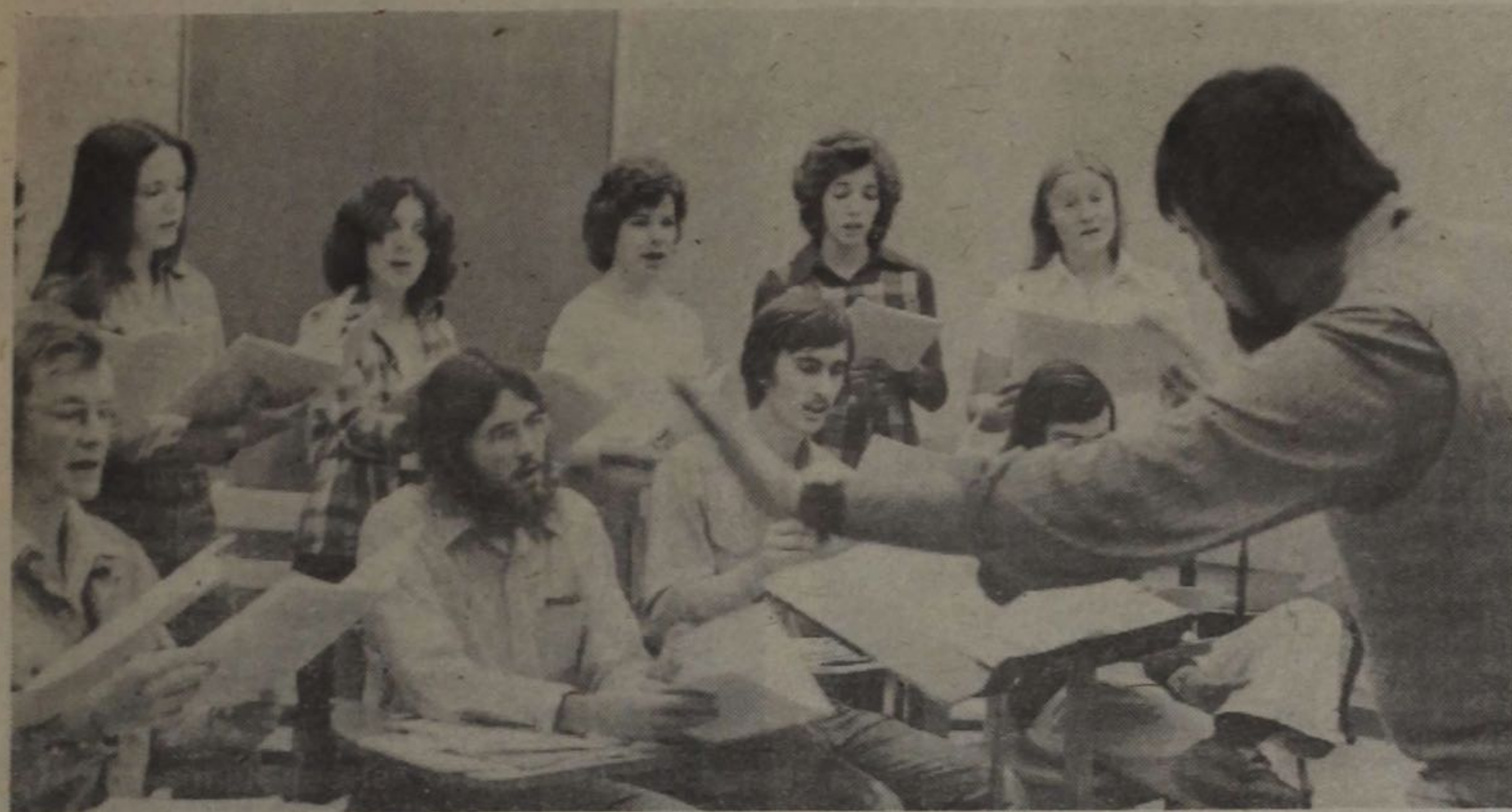
More conducts his singers as they practise their program