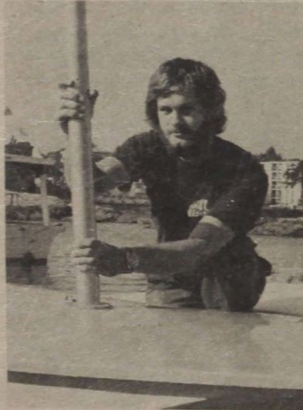
Severide: interest in sailing is up

sailing at the basic level," said Severide. "The main reason for all the interest is the new lasers."