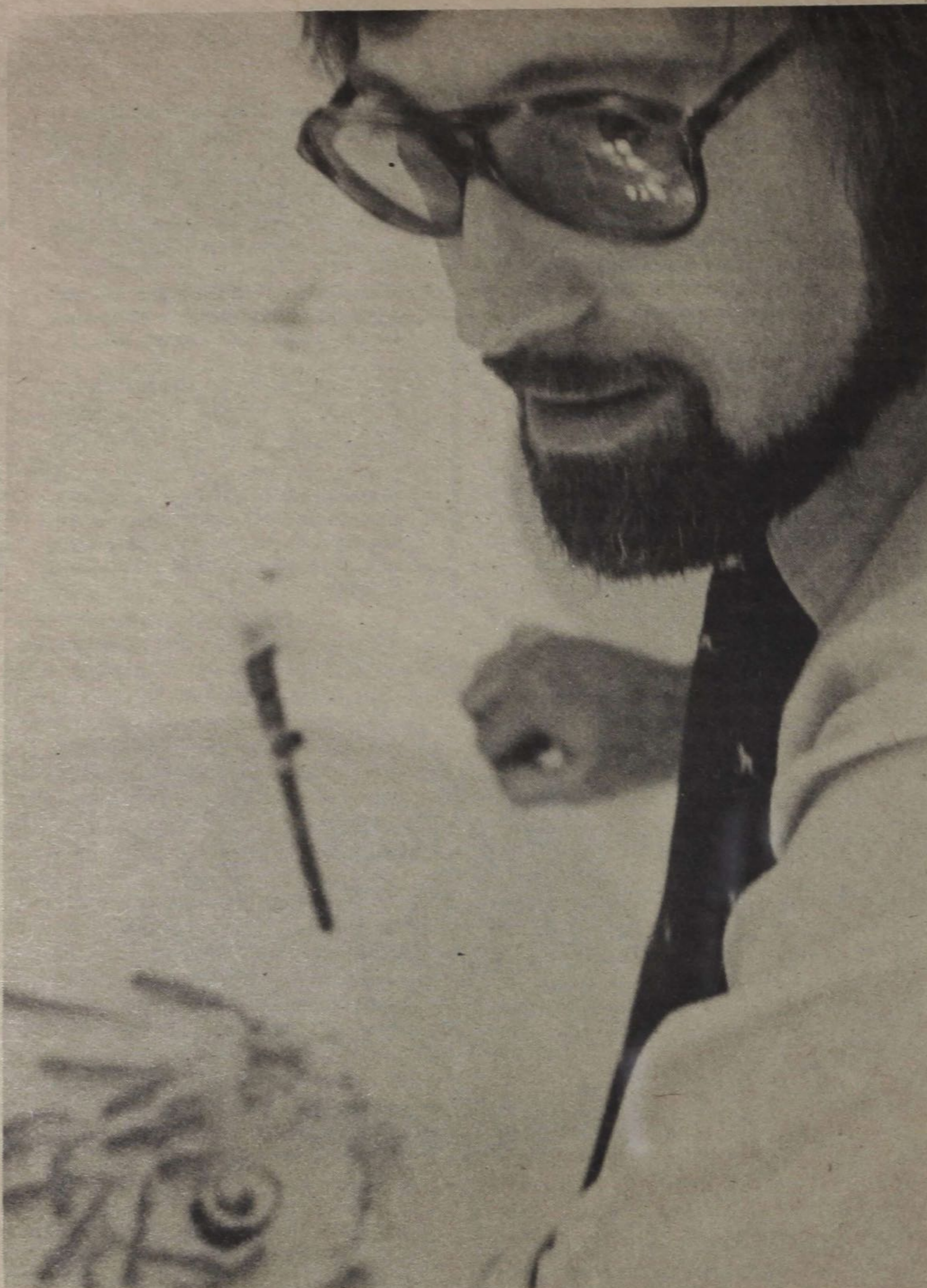
Trust with a tank of trout fingerlings.