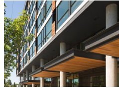
Integrate Increased Height and Density