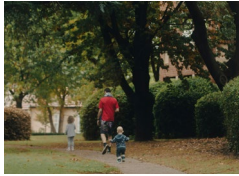
Design for Everyone