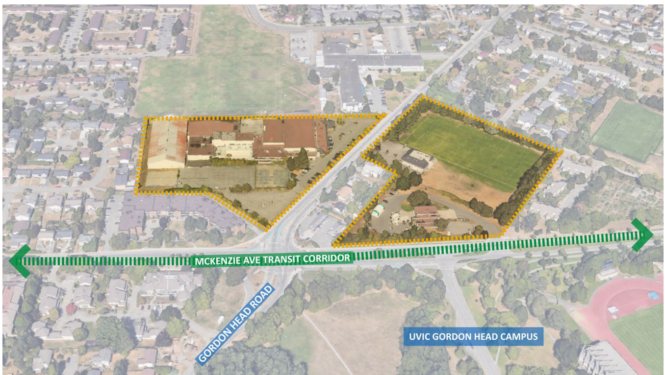
University District Development Lands

The first round of community engagement was held in November and December 2023. Over 900 individual engagements occurred with the campus community and broader Saanich neighbours. The top responses were a desire to bring vibrancy to the neighbourhood and develop new housing options near the main campus.