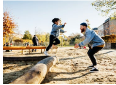
Prioritize Community Well-Being