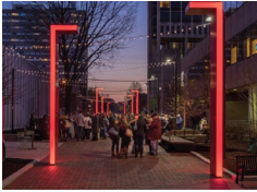
Create a Unique Sense of Place